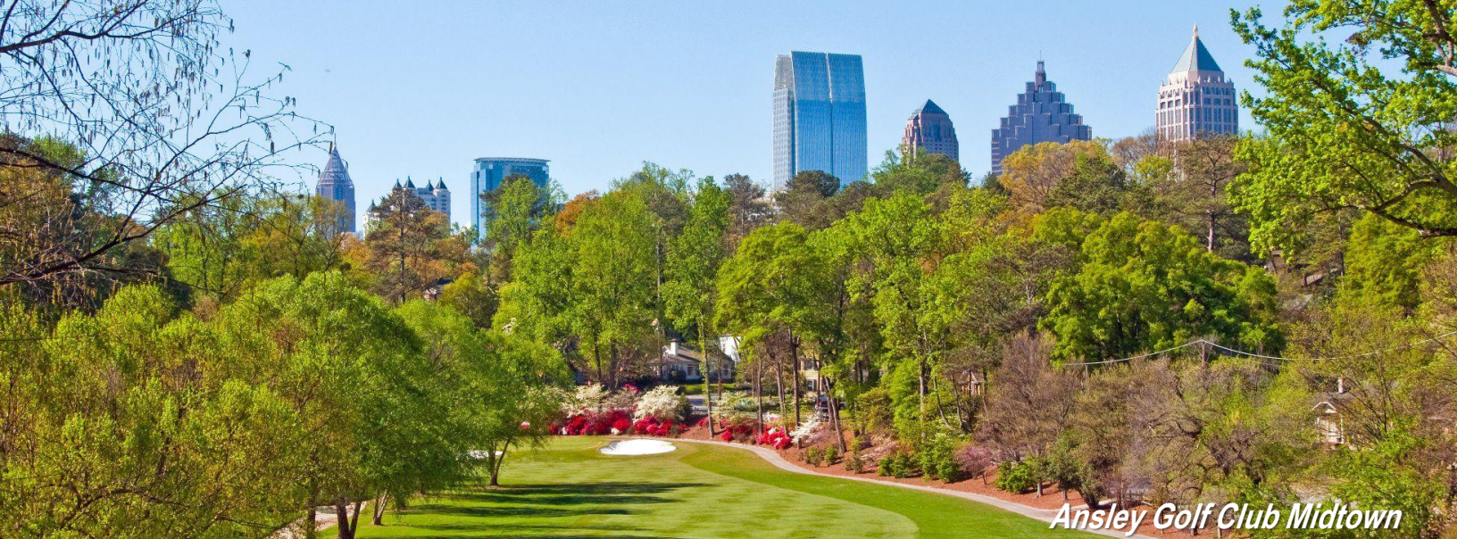
Ansley Golf Club Midtown