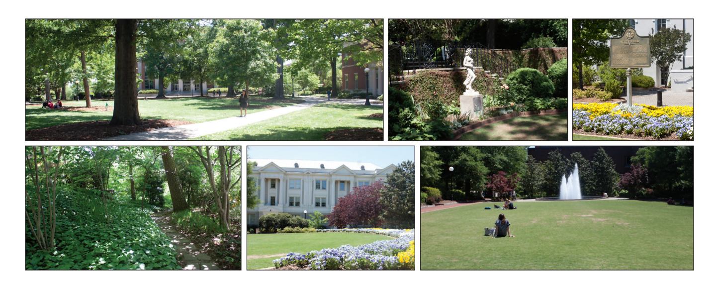
A walk through North Campus Will enable you to experience one of the most beautiful university campuses in the nation. From fountains to open green spaces, the North Campus gardens offer a restful place amidst deadlines, tests, and appointments. Herty Field offers an open lawn with the sound of the fountain splashing in the background. Escape the fluorescent lights, grab a blanket and your textbooks, and take advantage of the sunlight. Let the birds be your background music. Explore what the University has to offer outside of degrees and credit hours.